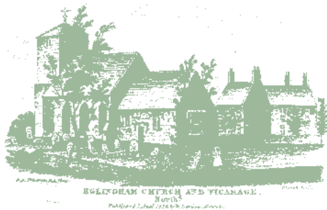
St Maurice's in 1824